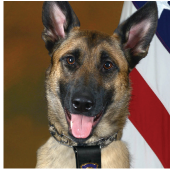
HONZA 10 Year Old, Belgian Malinois