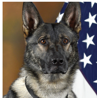
ROCKY 8 Year Old, German Shepard