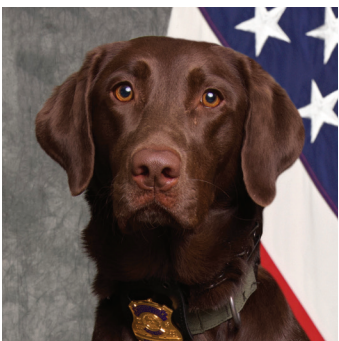
SKY 5 Year Old, Labrador Retriever