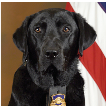
MOKEI 7 Year Old, Labrador Retriever