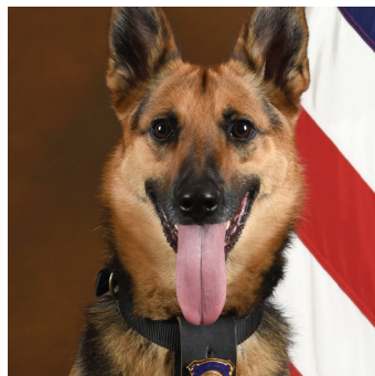
RIVER 10 Year Old, Belgian Malinois/German Shepard