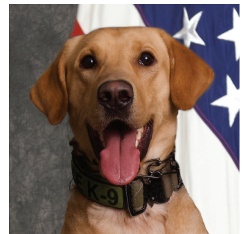
SCUBA 3 Year Old, Labrador Retriever