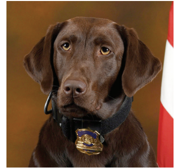
KITKAT 8 Year Old, Labrador Retriever