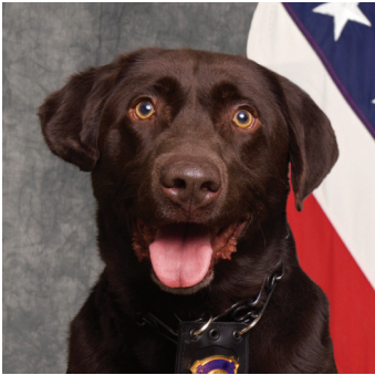
HERSHEY 6 Year Old, Labrador Retriever