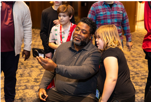
It is not usual for our special agents to participate in community outreach events to showcase some of their tradecraft for the next generation of secret agents.

The Threat Intelligence Center (TIC) manages and integrates intelligence collection, law enforcement information sharing, analysis, foreign national vetting, and open-source monitoring for threats directed at PFFA areas of responsibilities.